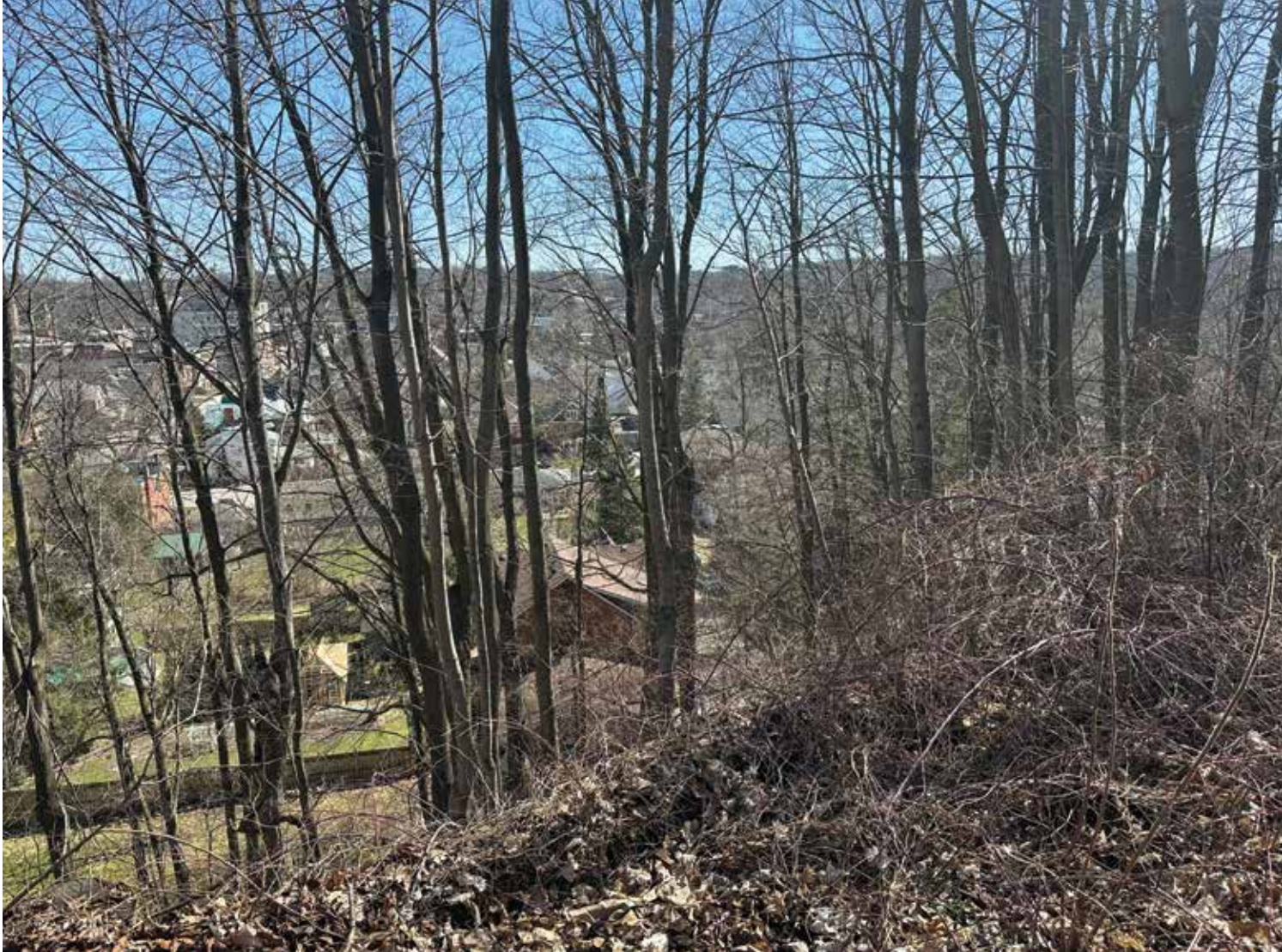
▲ Owen Sound from the edge of the Niagara Escarpment.

▼ Thick forests and Escarpment formations can make searching difficult.