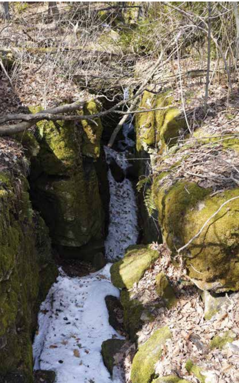
▲ Even in summer, there may still be snow in deep fissures of the Escarpment.