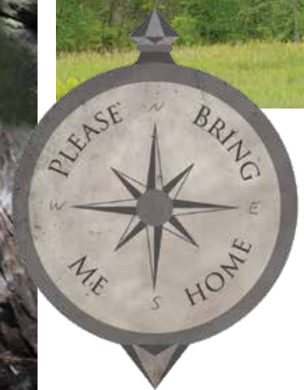
▲ Logo from the Please Bring Me Home Facebook page.