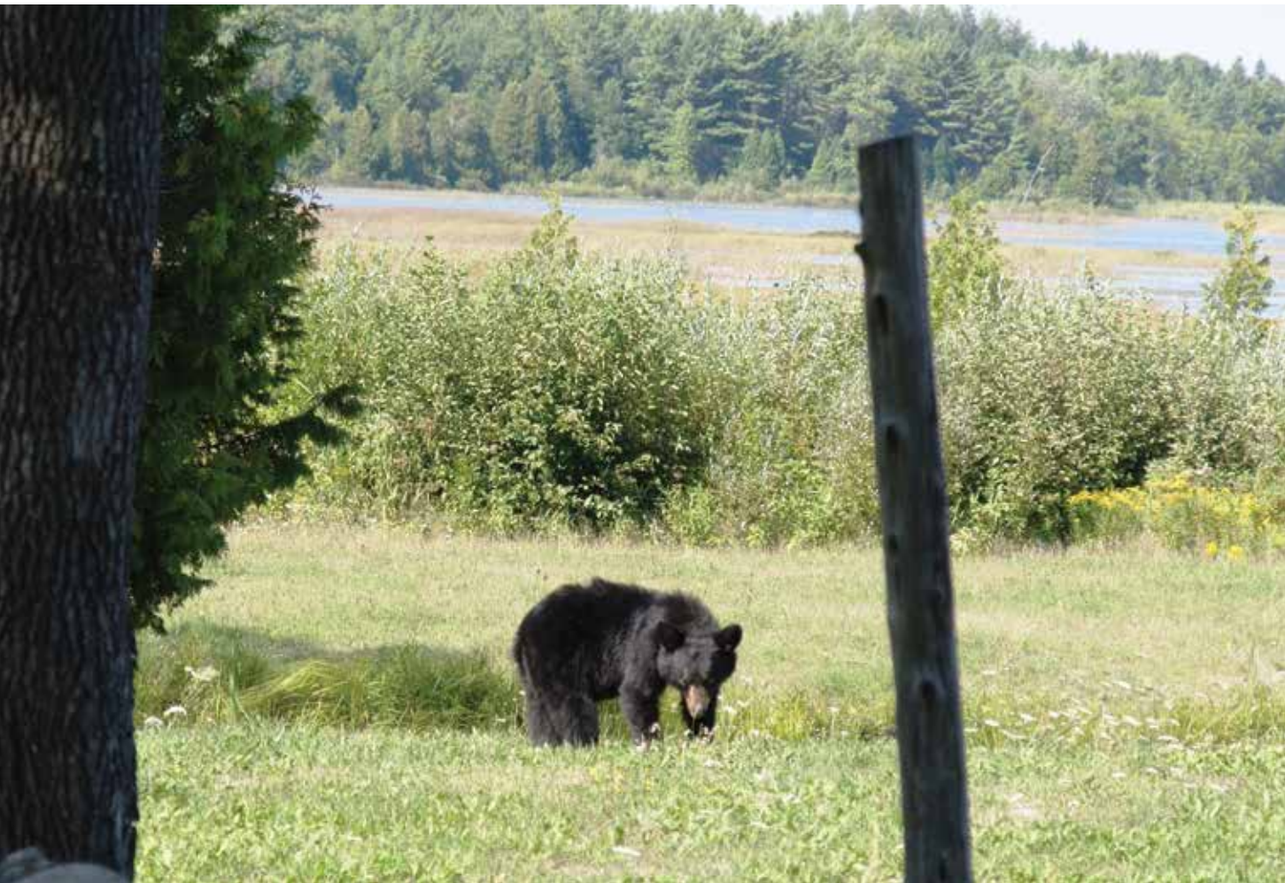
▲ Almost every search shows evidence of bear activity. This Black Bear was spotted on the Bruce Peninsula.