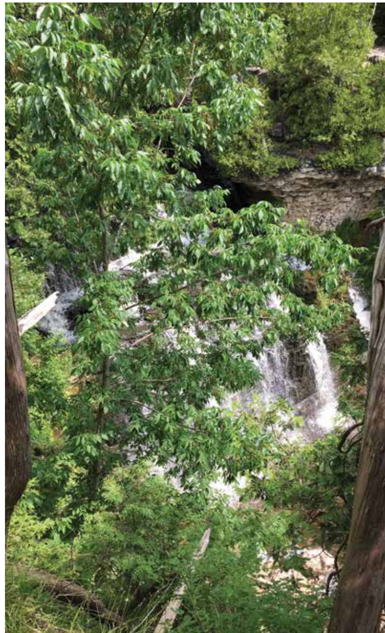
▲ Waterways like Pottawatomi Falls near Owen Sound may provide hiding places to be investigated.