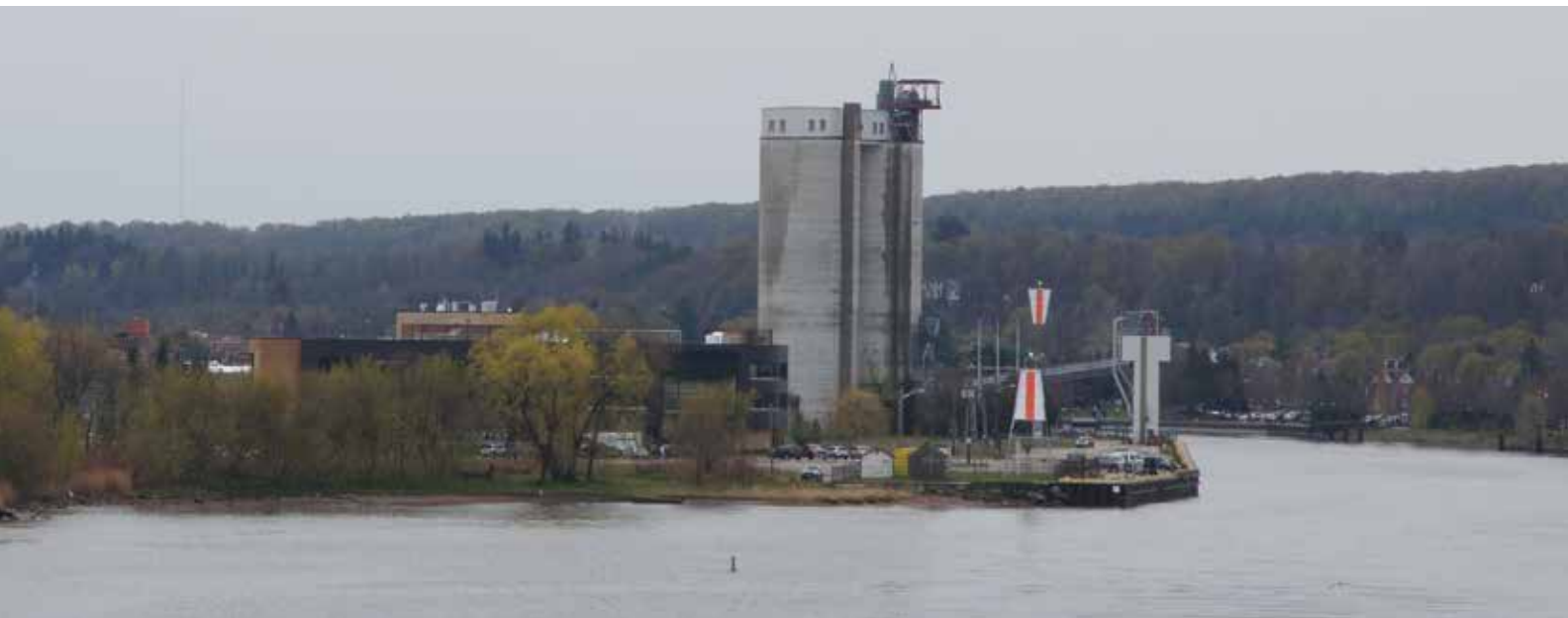
▲ The Niagara Escarpment is located near The City of Owen Sound and its harbour.