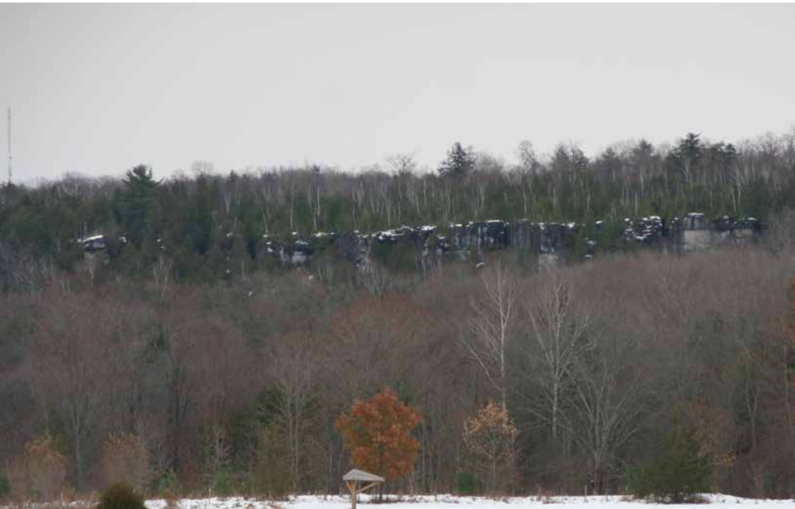
▲ Escarpment bluffs in winter are beautiful but can be difficult places to search.

least seven missing person cases in the area. Nick remembers they wondered, “What if we could help find a missing person and prevent them from turning into a decades-old cold case?”