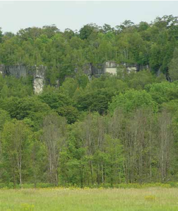
▲ White cliffs of the Niagara Escarpment near Owen Sound.